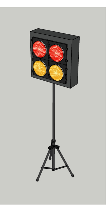
Example of Red and Yellow Lights