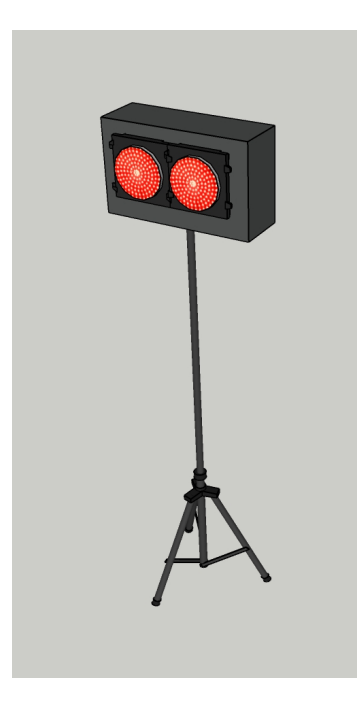
Example of Red Lights Only

Lights must be located a minimum of 10.0 meters (30.0 feet) and a maximum of 15.0 meters (50.0 feet) beyond the Start Line, ideally 5.0 meters (15.0 feet) from the edge of the track on either driver's left or right and between 2.0 meters (6.5 feet) and 2.5 meters (8.0 feet) above the track surface behind a protection barrier as required.